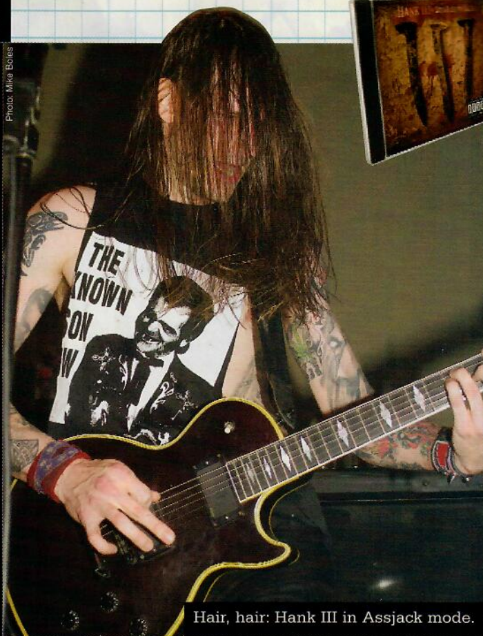
Hair, hair: Hank III in Assjack mode.

The tiny cabin is littered with Marlboro boxes, and after he finds one with a couple sticks left he fires one of them up with another groan. He’s just 33, but he’s dog-tired. Hank III has been on the road for about 11 years and he’s exhausted from being constantly asked all the same stupid shit, like how it feels to be the grandson of Hank Williams. But he tells it like it is—how he’s at peace with his legacy: “I’m from that blood. It’s got its pluses and its minuses. It doesn’t matter. It’s just one of those things, man.”